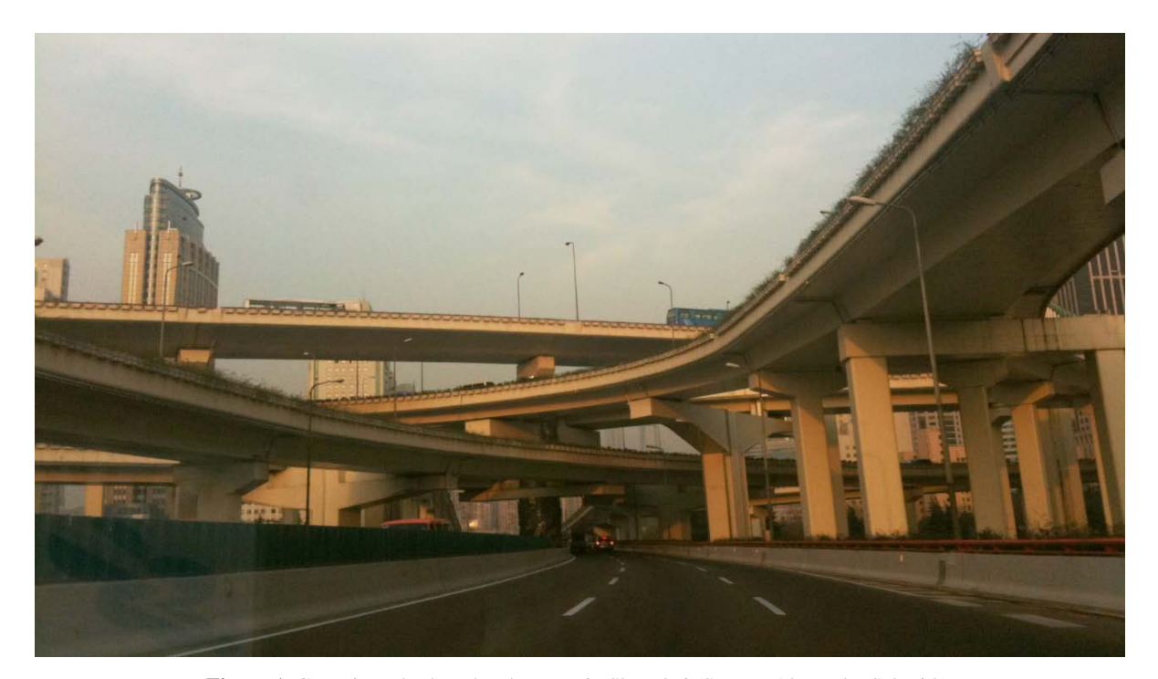
Figure 1. Car-oriented urban development in Shanghai

The causes for health and illnesses cannot be explained on an individual level anymore. Rather, it is found that health occurs as an interaction between individual, social and built environment. Individual measures alone are not sufficient to allow urban population to lead a healthy lifestyle. Rather, fundamental environmental changes are necessary in order to permanently establish healthy behavior for all<sup>[11]</sup>. A health-maintaining environment must therefore not only reduce direct health risk factors such as noise and particular matter (pathogenic concept), but also contribute to health chances that may indirectly promote healthy behavior (salutogenic concept) on which the