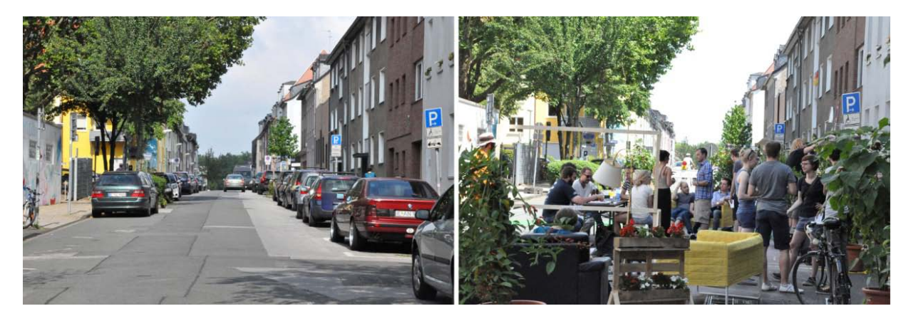
Figure 5. Urban intervention "Urban Living Room" in Essen — before / after.

Apparently it is a worldwide phenomenon that planning and urban development are not committed enough to health issues but still to the automobile and to urban mobility, which is dealt in a highly sectoral way and not considering social and health implications. In the end, for all sectors dealing with the planning and design of health-promoting cities and neighborhoods it is a matter of pursuing the common goal of reducing health threatening conditions, promoting human health, and at the same time increasing the