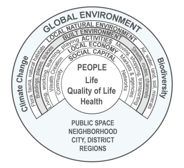
Figure 2. Health map. Own illustration based on Barton<sup>[14]</sup> developed from the model by Dahlgren and Whitehead<sup>[15]</sup>.

Regarding the effects of the built environment on health, numerous evidence-based findings exist<sup>[16,17]</sup>. For example, individual behavior and lifestyle are affected by the presence, safety and quality of routes and uses, by the density and structure of cities, and by the distances to certain destinations. Broader environmental conditions, including air, water, soil and climate, are affected by planning policy and can even be critical to health in some contexts<sup>[18]</sup>. A study lead by WHO identified twelve health objectives for planning, related to equity, exercise, social cohesion, housing, work, accessibility, food, safety, air quality,