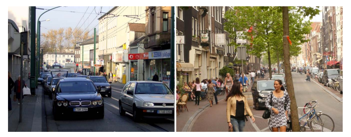
Figure 3. Car-oriented street space versus people-oriented street space.

Walkability research in the fields of traffic planning and health science is therefore focusing strongly on the measurable extent or likelihood of walking in relation to different environmental characteristics based on analysis models<sup>[36,37]</sup>. Measuring walking behavior serves to inform policy and planning and to evaluate its impact<sup>[38]</sup>. An increased interest in research on an international level was very promising, reinforced by